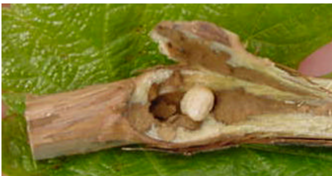
Elephant weevil grub in wood (Wood 2001)