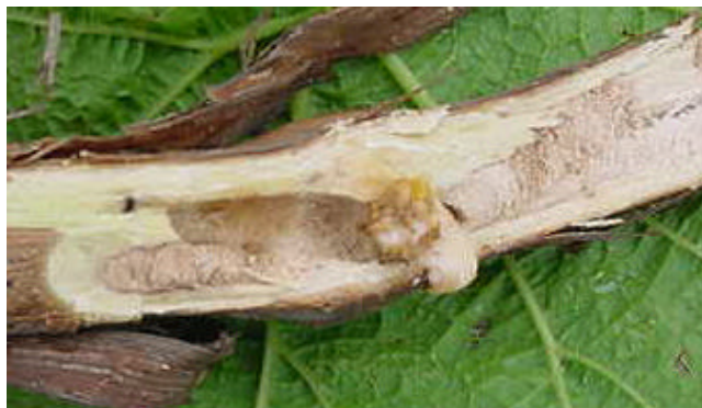
Hole in cordon and grub (Wood 2001)