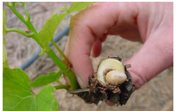
Live elephant weevil grub coming out of wood (Wood 2001)