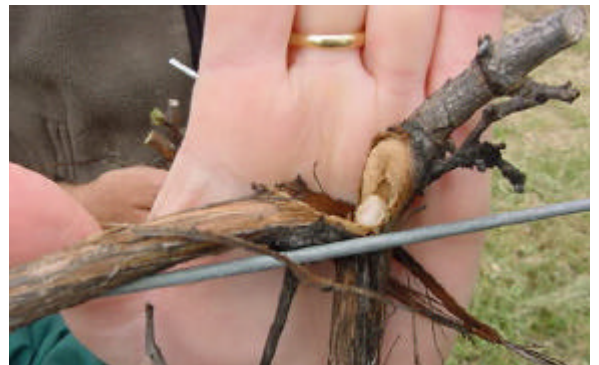
Grub in cordon (Wood 2001)