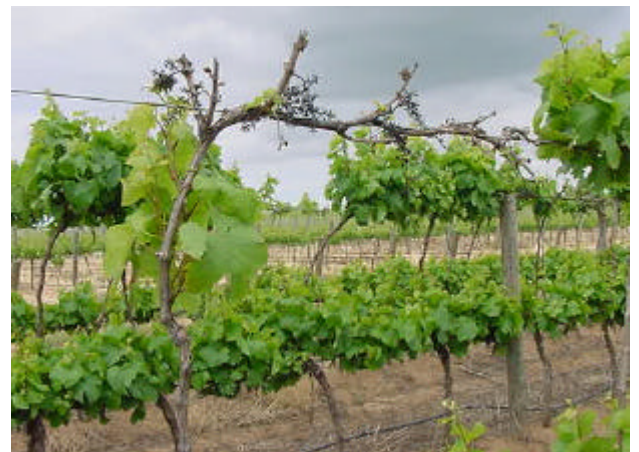
Top cordon at Peechabella (Wood 2001)