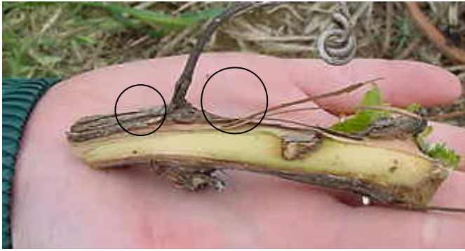
Elephant weevil holes from the outside (Wood 2001)