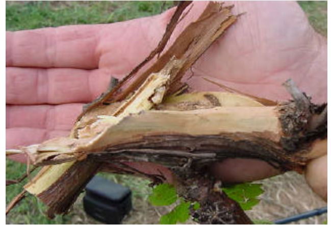
Holes from inside going out (Wood 2001)