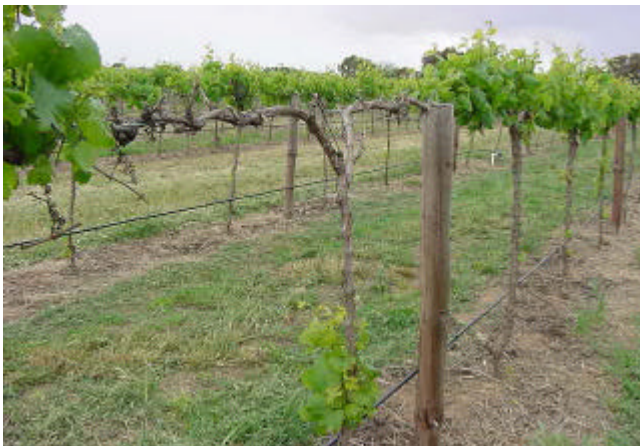
Vine death due to elephant weevil (Wood 2001)